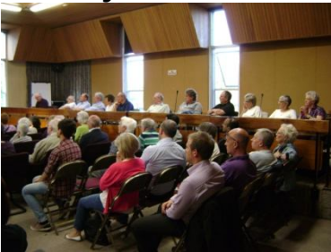
A full civic office at our AGM