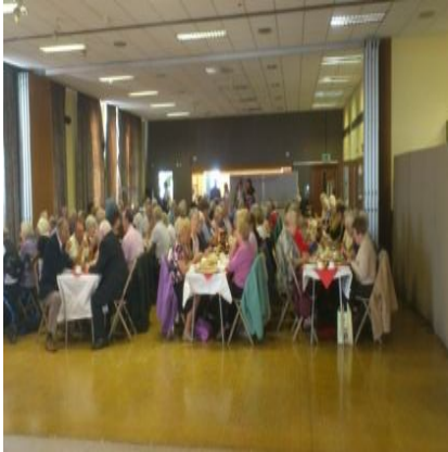
As the stands close the guests await their meal.

Telephone Office 0208 284 5537 or Email us: bexwatch-office@btconnect.com WEBSITE www.bexleywatch.org.uk