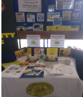
Our NW stand at The Old Peoples Forum

Our aim is to get out and about in Bexley Borough before Christmas and remind people to be extra careful and vigilant over this Christmas period and to also try and tap into the festive spirit to see if we can recruit new coordinators at the same time.