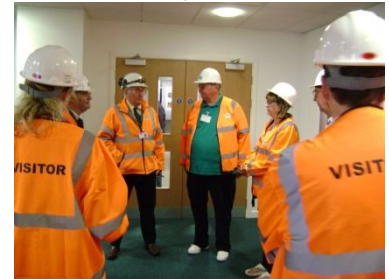
The 1 st group start their tour

CORY RIVERSIDE PLANT TOUR FOR NW MEMBERS - photos below