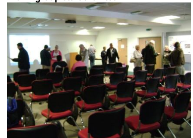
The after tour discussions room